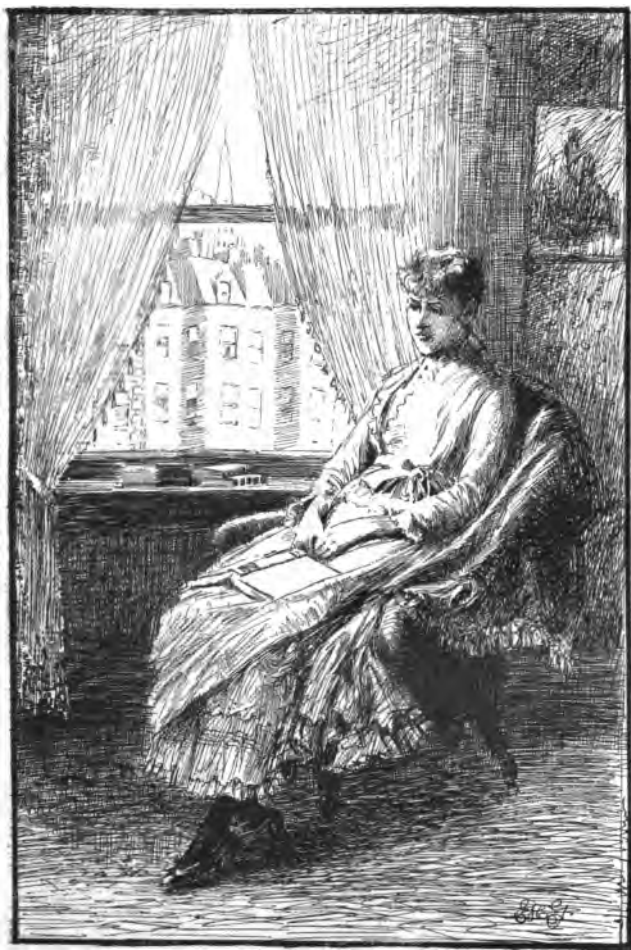
“ACTUALLY FROWNING IN A FORGET-ME-NOT BOWER.”